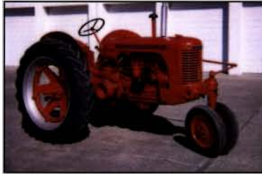
Feature Tractor CASE

Corner of Lincoln & Michigan Ave. SOUTH JACKSONVILLE