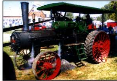
Feature Steam Engine CASE