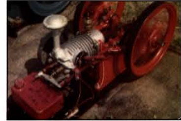
Feature Stationary Engine ASSOCIATED